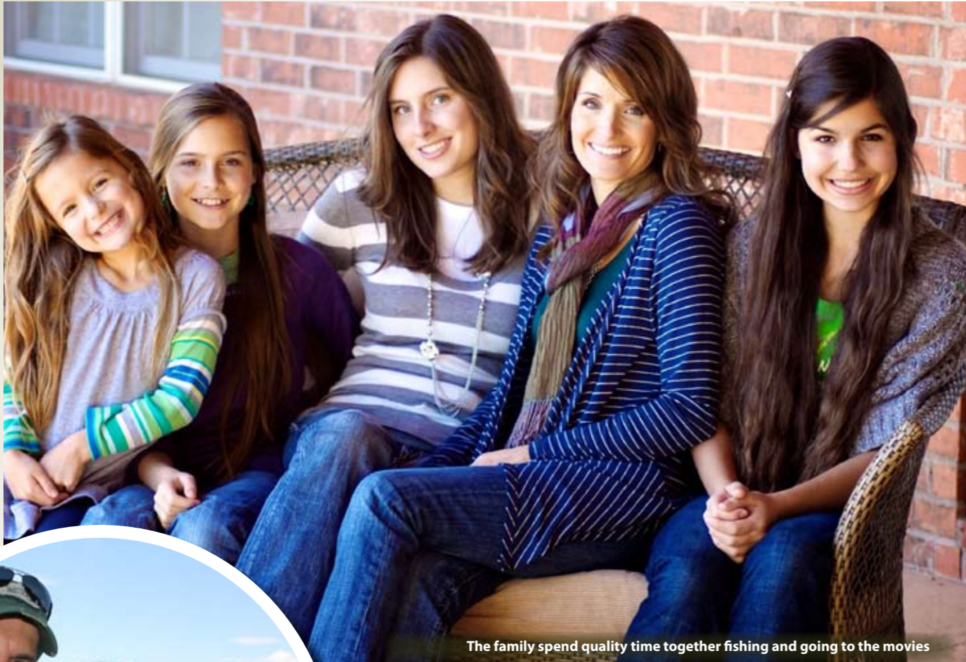
The family spend quality time together fishing and going to the movies